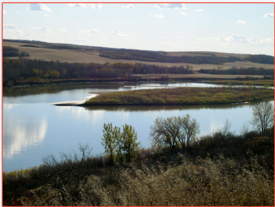
RHPRI acknowledges that its tour route is in Treaty 6 Territory , traditional homelands of the Cree, Nakoda, Saulteaux and Metis people. Treaty 6 was signed at Fort Carlton , 1876.

OVERVIEW This self-guided tour route offers a glimpse into the rich cultural and natural history along the west side of the North Saskatchewan River between Petrofka Bridge and Wingard Ferry in Saskatchewan, Canada.